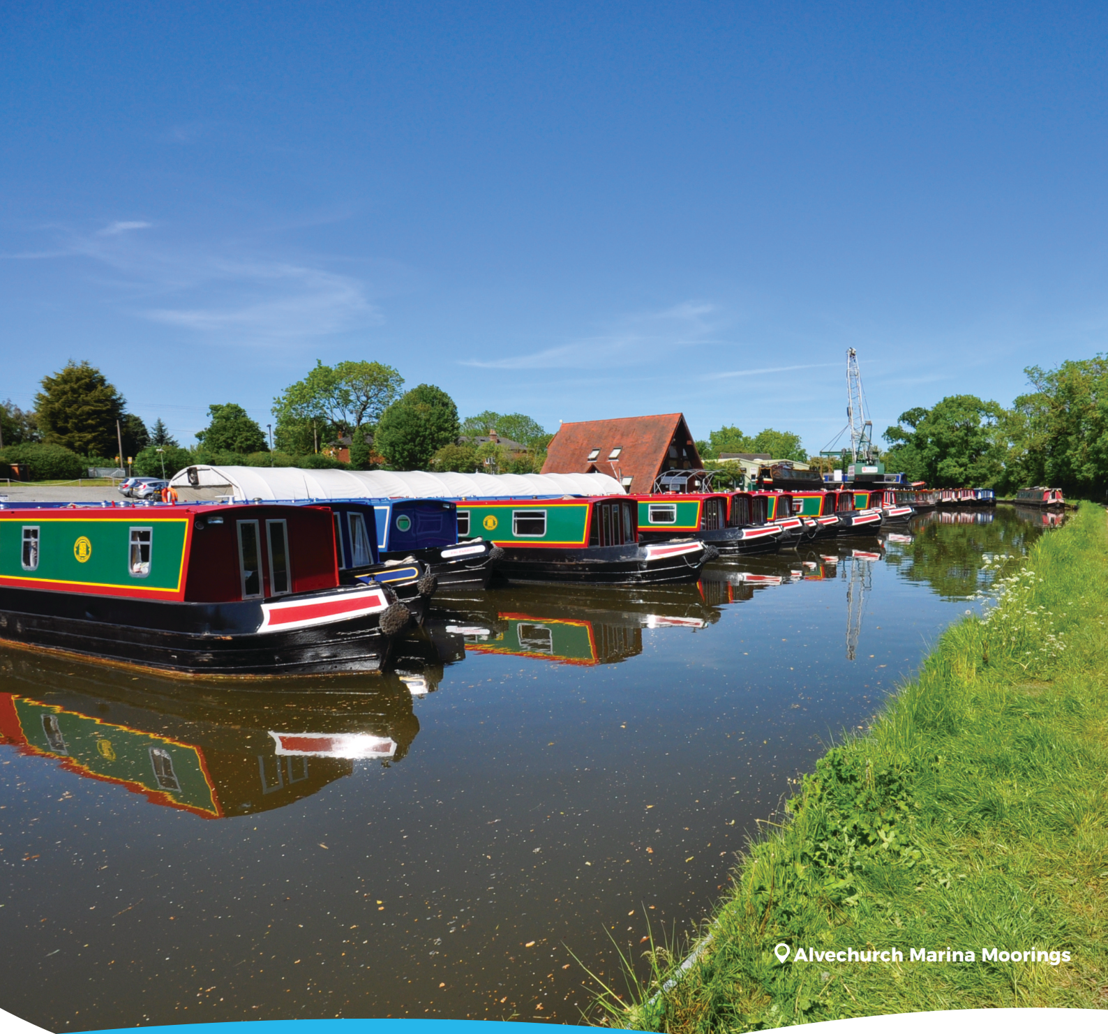
📍 Alvechurch Marina Moorings