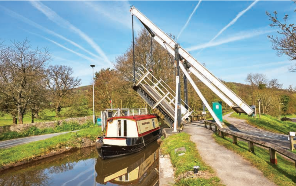
Downloaded by Jane Cumberlidge from waterwaysworld.com

Crickhowell. Below the canal at Llangattock you can cross the Usk on an ancient stone bridge with 13 arches. In Crickhowell visit Webb & Sons' fascinating department stores, opposite the Bear Hotel. The high street has some great shops selling local produce and there are many good eateries. Brecon Cathedral. There are free lunchtime concerts on Fridays in summer, and the tower has fabulous views over the town and Beacons. Pilgrims tearooms is in the old Tithe Barn. Brecon Tap. New in the centre of Brecon, 'Brecon Tap' is run by Ob and Will and serves tasty pies and fine cask ales. Their smooth and malty Copper Beacons ale is superlative. Industrial history walks. From several places on the canal there are walks to the old tramroads and workings for which the Mon & Brec was built. Starting at Llanfoist you can explore Hill's Tramroad on the Blorenge. From Talybont, follow the Brinore tramroad to Talybont Reservoir.