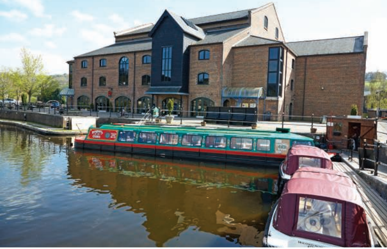
Left: Brecon Basin and Theatr Brycheiniog. Below left: Brecon Cathedral. Below right: There are carved benches all along the canal.